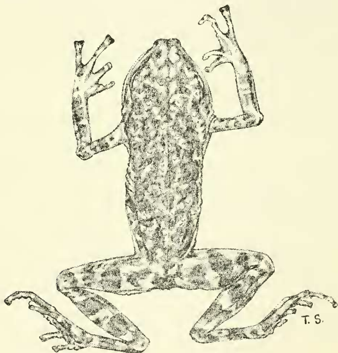
FIG. 1. Tomodactylus saxatilis new species, adult male, KU 63326, holotype ( \times 2 ), dorsal view.

ous forest at lower elevations. The mixed boreal-tropical habitat is most conspicuous at elevations between approximately 7800 and 5500 feet on southerly exposed slopes of barrancas and arroyos of the dissected plateau of the Sierra Madre Occidental. The mixed boreal-tropical habitat occurs for approximately 30 miles along the paved highway (Mexican Highway 40) between Cd. Durango, Durango, and Mazatlán, Sinaloa. The records of occurrence in those states that are along this highway are separated by 14.5 miles ( via road ).